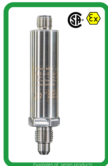
Examples of series products